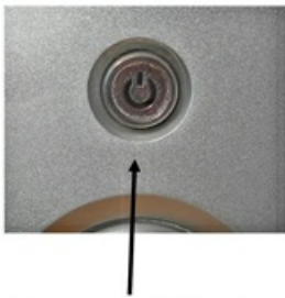
This is a typical PC on button, on the front, in the middle of the tower

Step 1: Find the 'on' button. It probably looks like this (but might be square or oblong!):