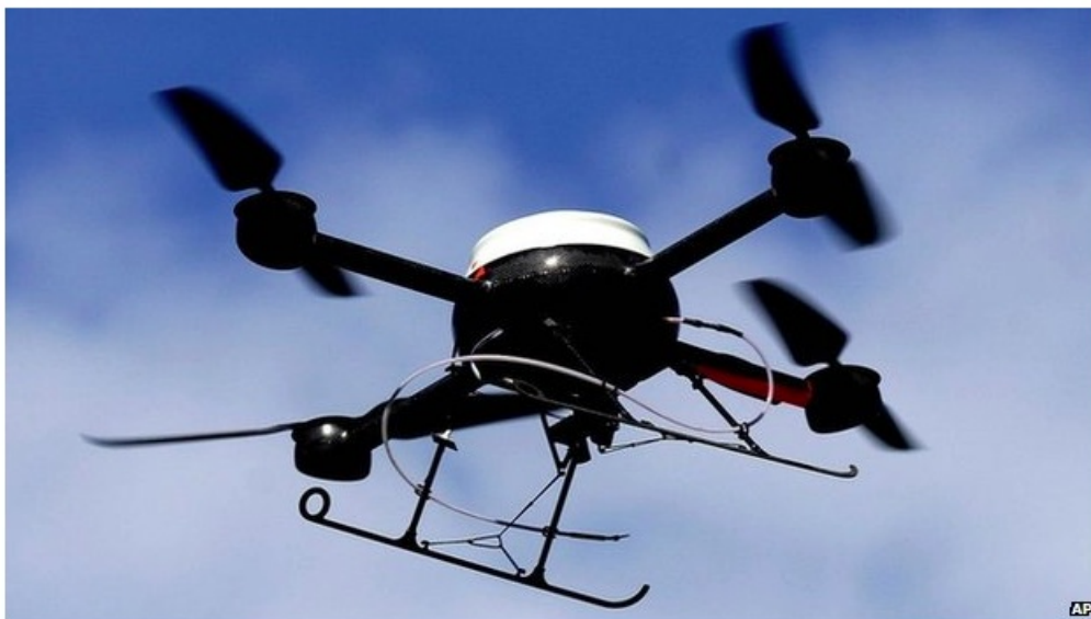
Drones can be used in a variety of ways, such as using CCTV cameras to help combat anti-social behaviour

Step 4: You can delete your own Tweets on Twitter. You cannot delete Tweets which were posted by other accounts. Instead, you can unfollow, block or mute accounts whose Tweets you do not want to receive.