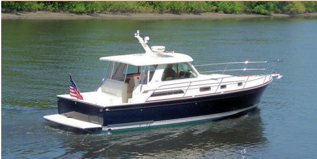
Sabre 38 Hardtop Express

The Sabre 38 is a true gentleman's motor-yacht, powered with twin Yanmar 440hp with beautifully finished cherry joinery and first-class accommodation. Noted by Motor Boats & Yachting for 'exemplary handling' and her outstanding rough weather ride, the Sabre 38 is a fast, safe and very comfortable place to be.